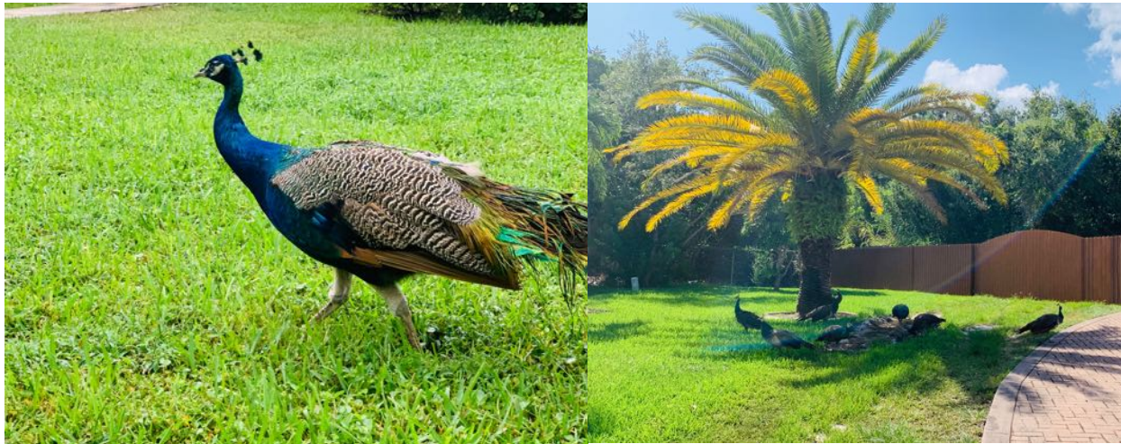
Peacocks are Kings in the Sunshine State ...