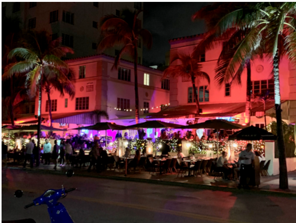
Legendary Ocean Drive, flavoured with the Vibes of Buena Vista Social Club Music.

Ocean Drive , the legendary hotspot of the 1980s and 1990s near Miami Beach , seems a bit bedraggled; the facades of the beautiful Art Deco hotels and restaurants seem a bit more gaudy than at that time. A friend takes us to an open-air concert at a "Buena Vista Social Club Tribute Night" with the Combo Cortadito. In the Lummus Park, on a meadow under palm trees, people of all ages gather, sit in grass or dance on the small dance floor. Hips swing in Salsa Cubana and L.A. style. Small food and drink stalls surround this beautiful area. Everyone looks relaxed and happy. Being immersed into this world class setting and atmosphere we ask ourselves why there must be so much suffering and wars in the world when an evening like this shows how peaceful living together can be... People here are connected through music, dance, shared passions and humanity. Dancing Souls they are – 1001 of them and more. We yield hope.