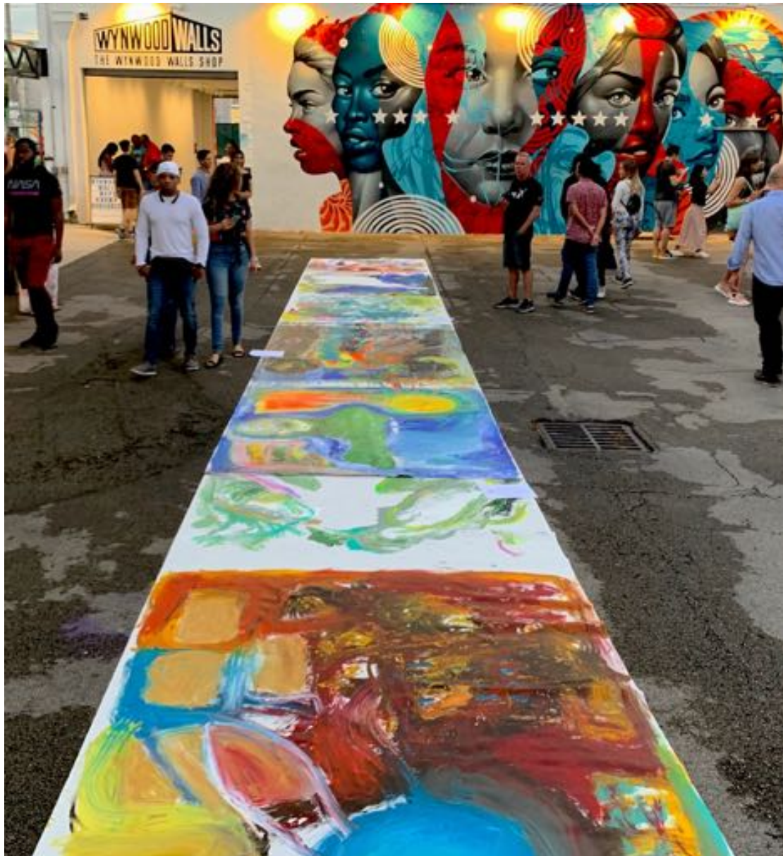
1001SOUL painting made in the U.S. displayed in one of the courtyards of the Wynwood Walls Area, Miami. Street Art meets Soul Art.

and back, the cars are "dancing" at snail's pace to low-speed basses. A rickshaw driver drives his gigantic snake for a walk. There is hardly any passer-by who does not walk on and off in a conspicuously dressed manner. If you want a Wynwood cinema, all you have to do is stop and marvel. Guaranteed no boredom here. Given the scenery, we decide to roll out the 1001SOUL screen made in the USA here, between the walls of the Wynwood Walls . Street artists from all over the world play on the walls in this spacious area. We roll out our art on the floor in one of the courtyards.